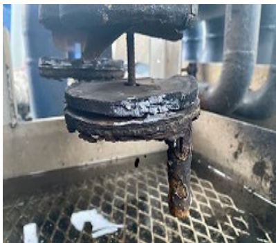
Figure 2 - Image of methane vent post casualty.

The Coast Guard strongly recommends that vessel owners, operators, and other stakeholders: